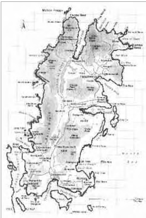
Outline map of Unst.