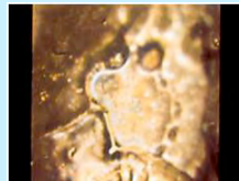
-----< This is Polluted water...

This is water from Lourdes, France. Utterly beautiful, right?