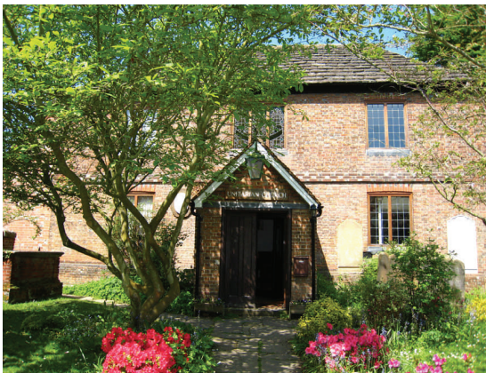
Horsham Unitarian Church

For many people, a civil ceremony is too brief and impersonal, yet they also feel out of place with a traditional church wedding service. They may not be churchgoers, or even 'religious' in the conventional sense, but they still feel a reverence for the vows made, and a wish to express their faith in life, in one another and in their future together.