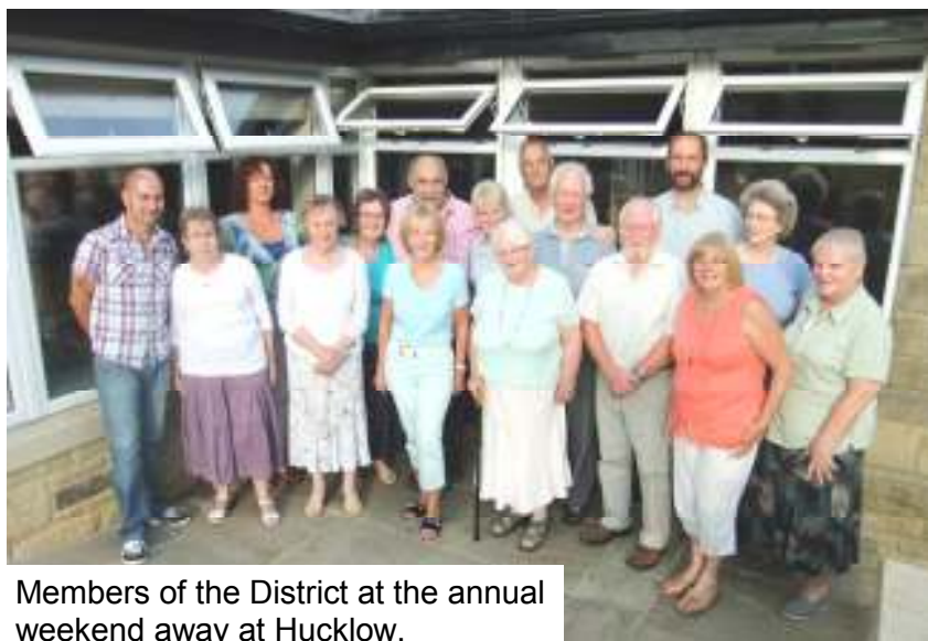
Members of the District at the annual weekend away at Hucklow.