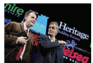
The Power of Yes by David Hare