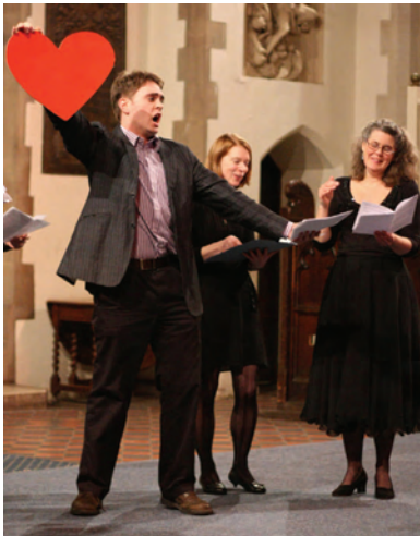
Last year's talent show