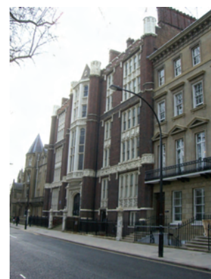
Dr Williams Library

Booking forms can be downloaded at http://www.dwlib.co.uk/dwlib/friends/Gaskellinvite.pdf Tickets are £17.50 each (including interval wine, juice and snacks) and must be paid for in advance. Tickets are non-refundable and will be allocated on a first-come, first-served basis. All bookings will be acknowledged. Friends of Dr Williams’s Library were posted out details of this event last week and bookings have been arriving steadily ever since. Please book early to avoid disappointment.