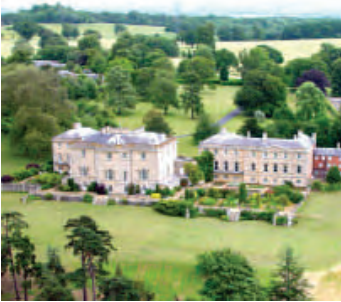
Global Retreat Centre, near Oxford

World Congress of Faiths, International Association of Religious Freedom and The Brahma Kumaris World Spiritual University are extending an invitation to join them on a 'Journey to Compassion' at the Global Retreat Centre, near Oxford 8-10 March 2011.