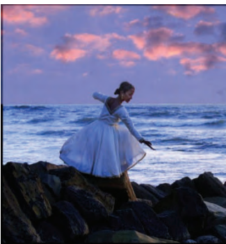
Indian Kathak dance - 'ONE' on Saturday 2nd April

Brighton's unique World Sacred Music Festival has been bringing people of all beliefs and cultures together through music since 2004.