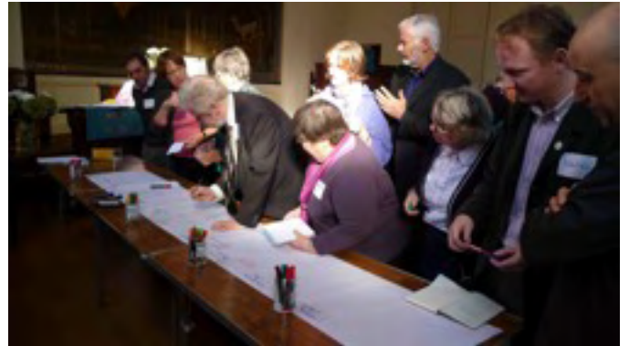
Charting the time line of Unitarian social action