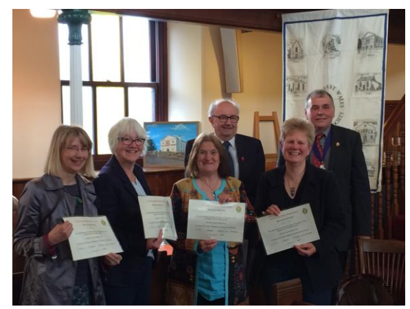
Rites of Passage students proudly display their certificates

Our thanks go to the Cefncoed congregation for hosting a most successful event.