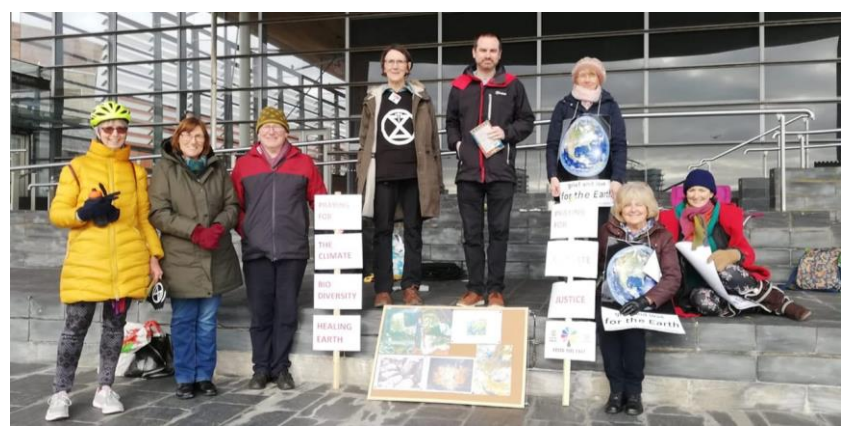
Members of the congregation at the Multifaith Prayer Vigil for Climate Justice at the Senedd.

Members of the congregation have also been taking part in a Multifaith Prayer Vigil for Climate Justice outside the Senedd (in rain and shine!). Joining with a prayer vigil being held outside Westminster 24/7 for the whole of Lent, we are joining together every Friday afternoon to pray that the Welsh and UK governments respond to the climate emergency. Anyone is welcome to join us. More details below.