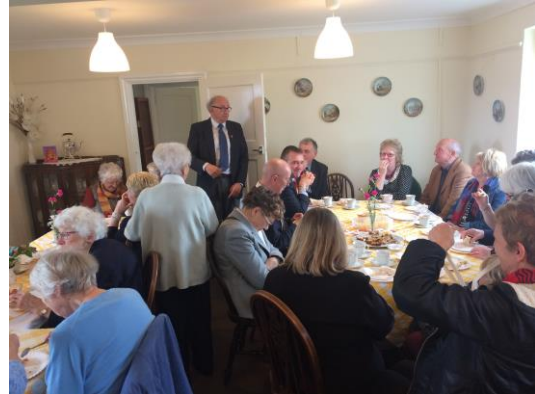
Lunchtime at Hen Dŷ Cwrdd vestry