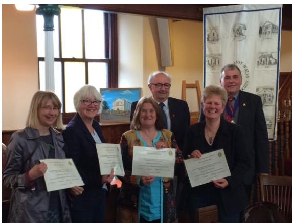
Rites of Passage students proudly display their certificates

Our thanks go to the Cefncoed congregation for hosting a most successful event.