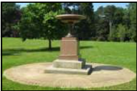
The urn which marks the site of the cottage in which Captain Cook was born. The quotation on the right is inscribed in the periphery of the foundation