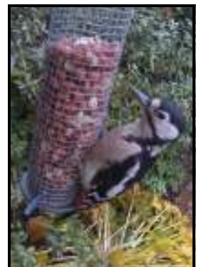
This woodpecker is a regular visitor to our garden in Ingleby Arncliffe