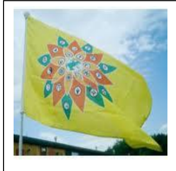
Flag of all faiths (£10)