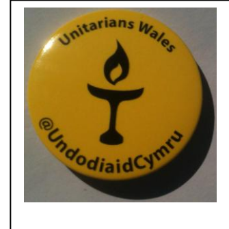
Unitarians Wales Badge (Free)